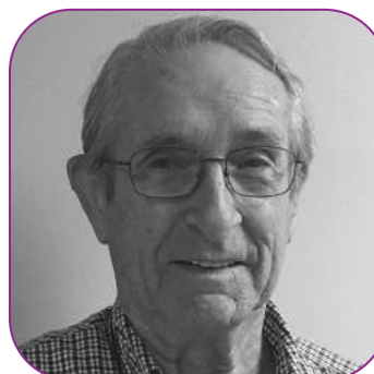
Dick Bus Driver