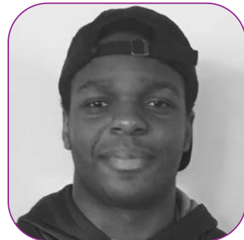
Titus Quest Camp Head Counselor